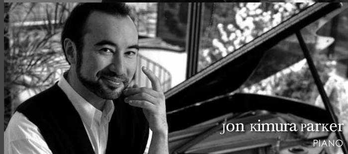
jon kimura parker PIANO